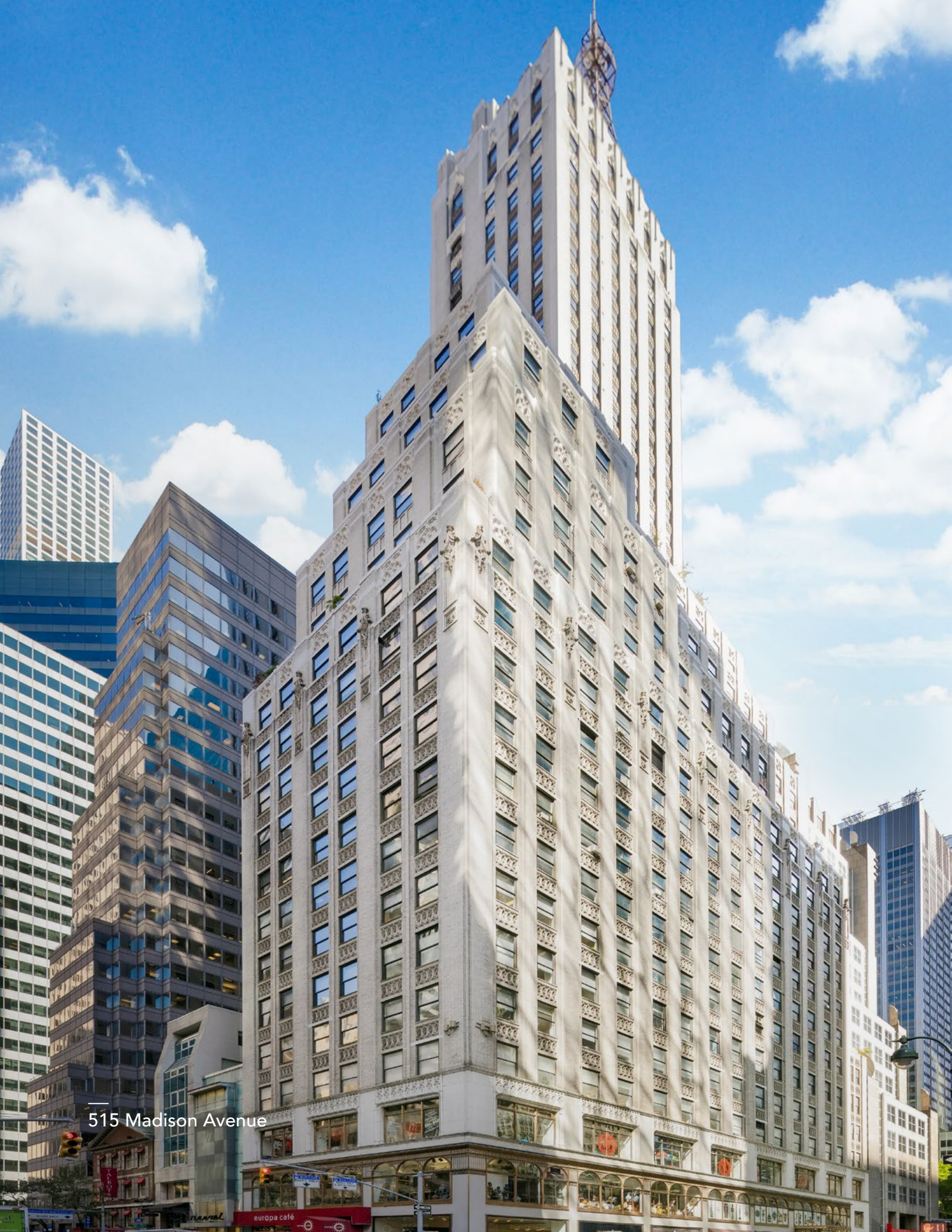
515 Madison Avenue