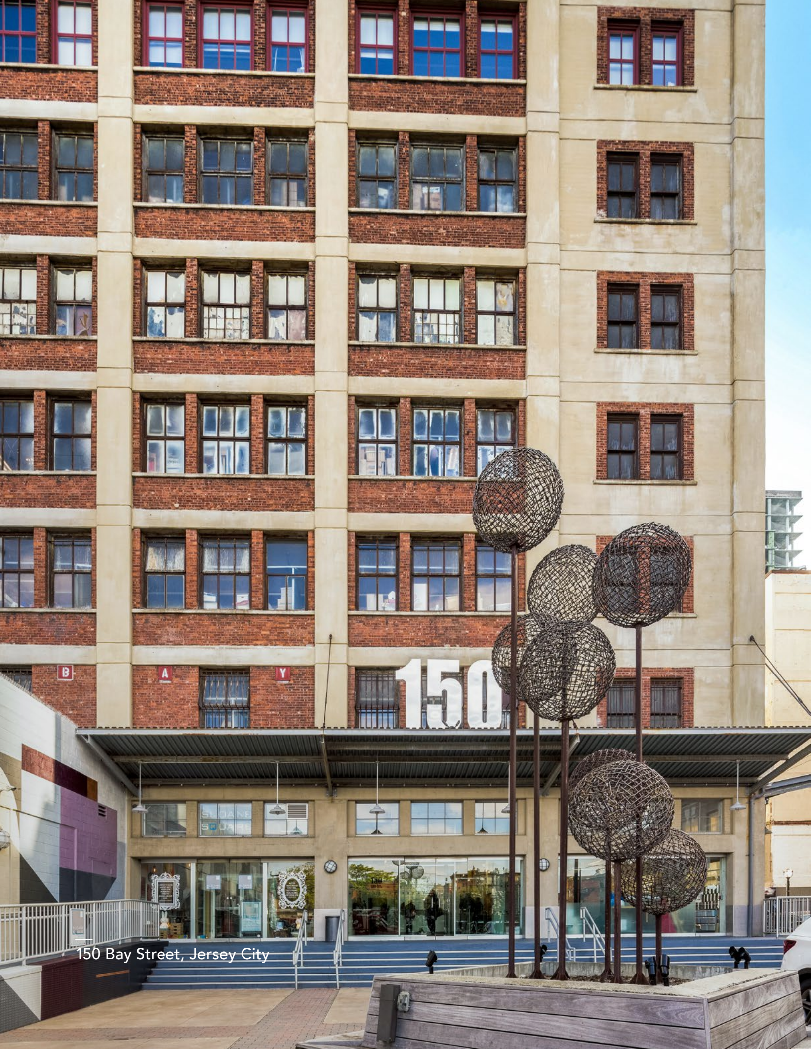
150 Bay Street, Jersey City