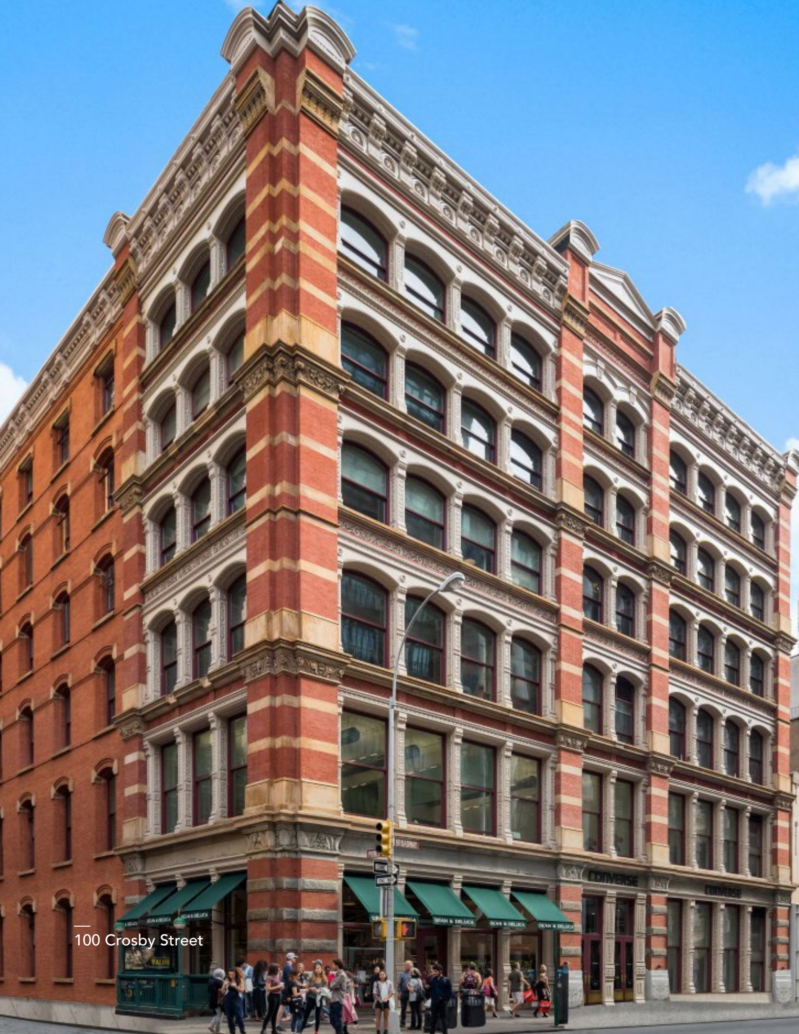
100 Crosby Street