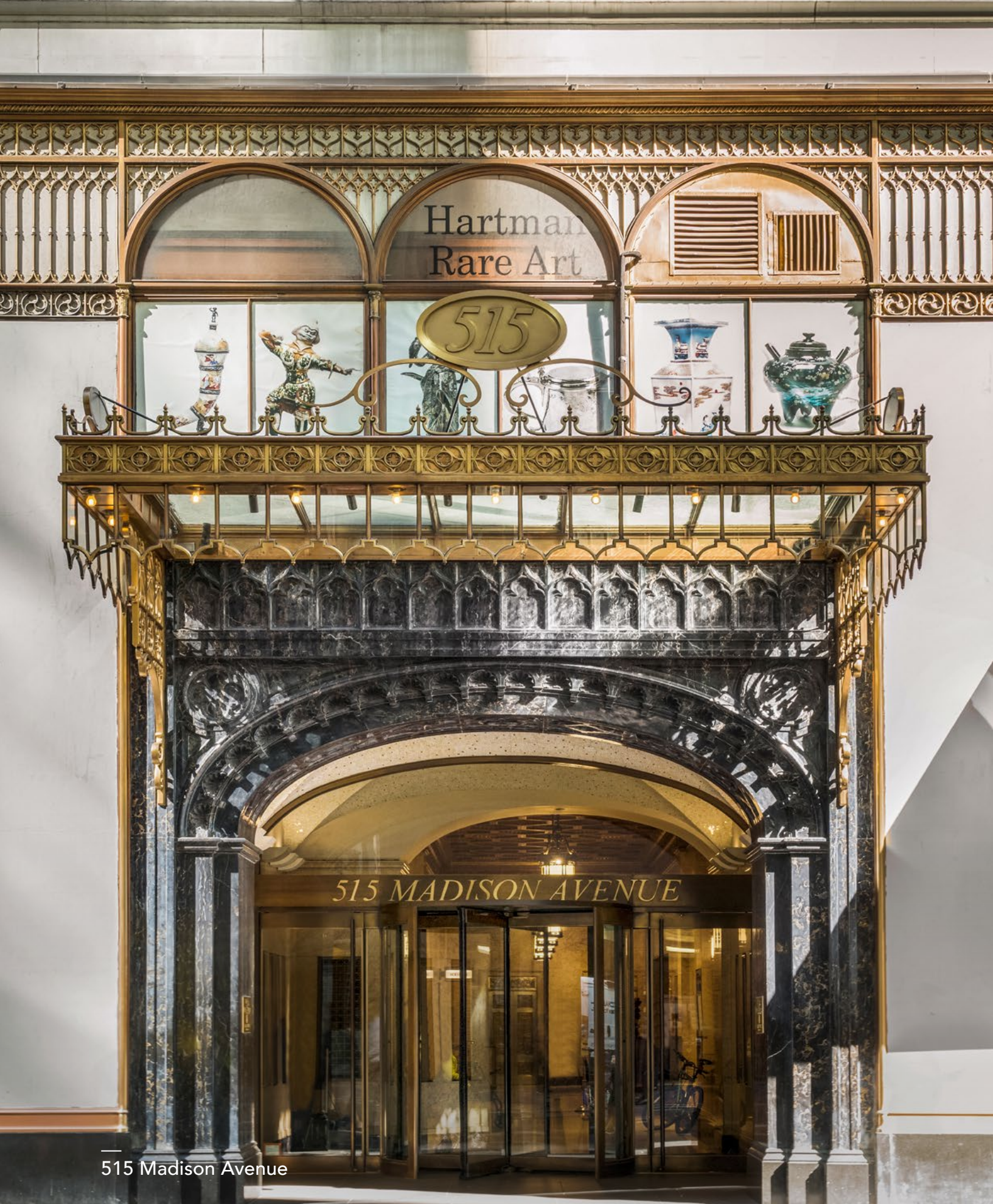
515 Madison Avenue