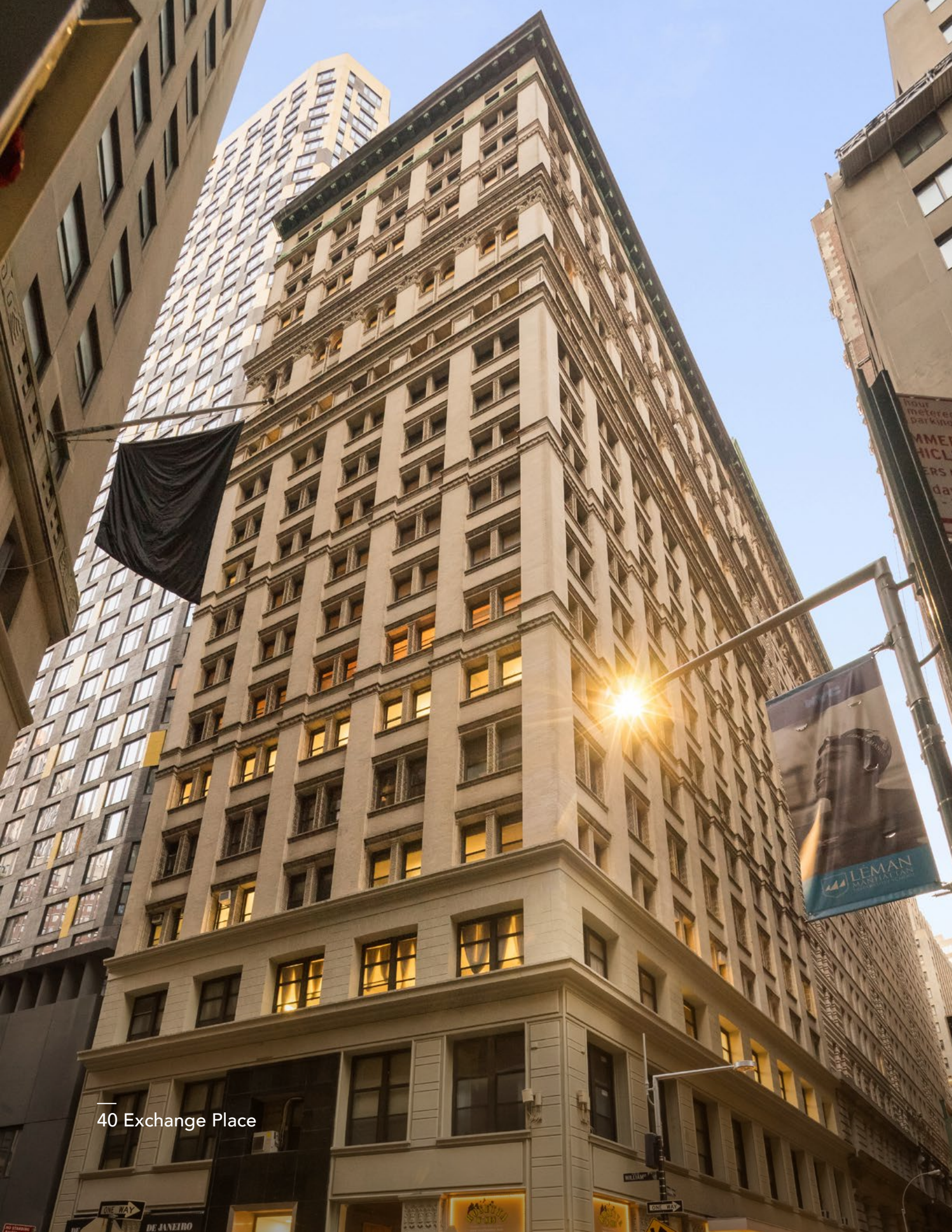
40 Exchange Place