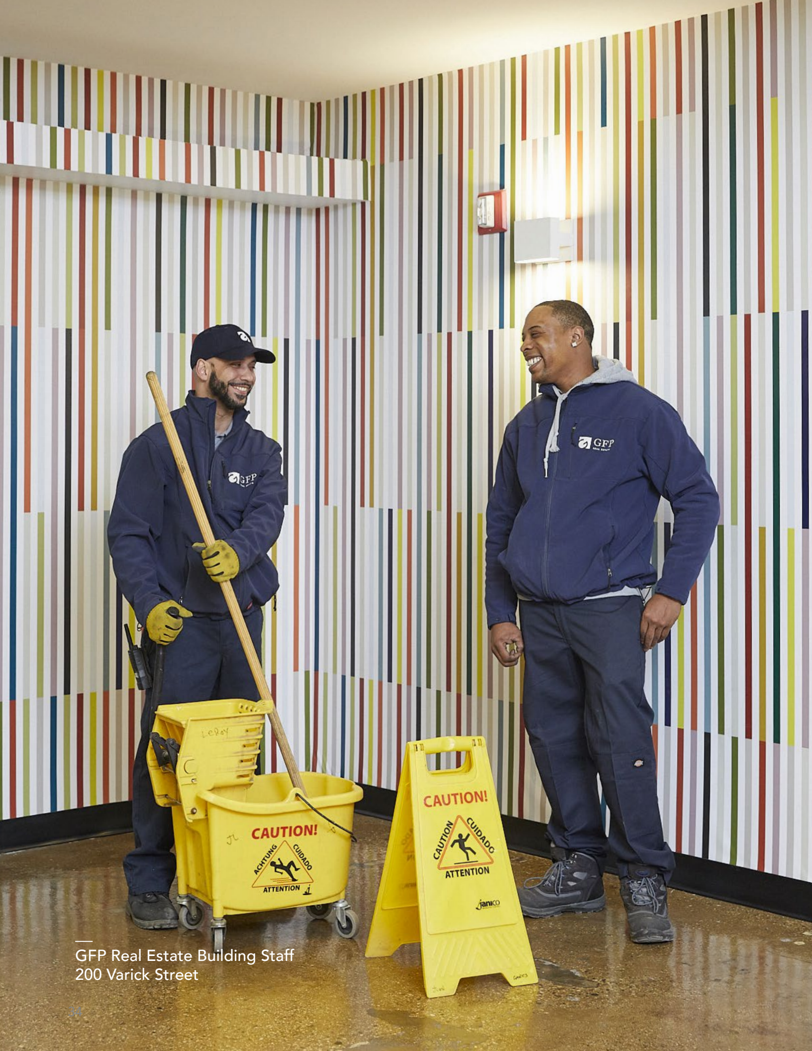
GFP Real Estate Building Staff 200 Varick Street