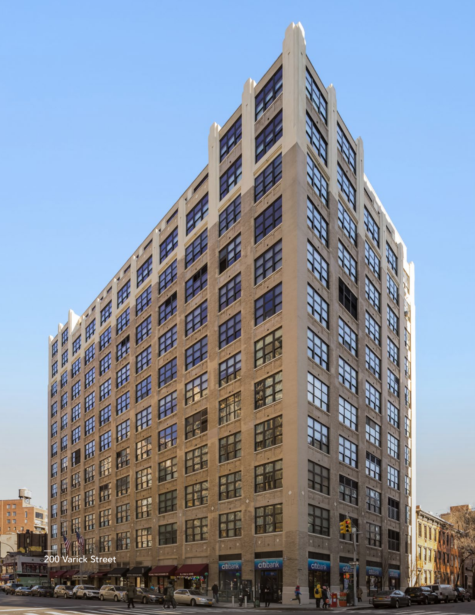
200 Varick Street