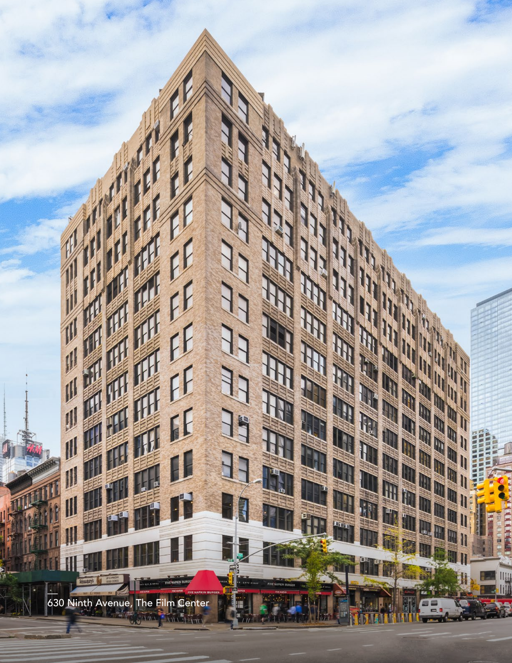
630 Ninth Avenue, The Film Center