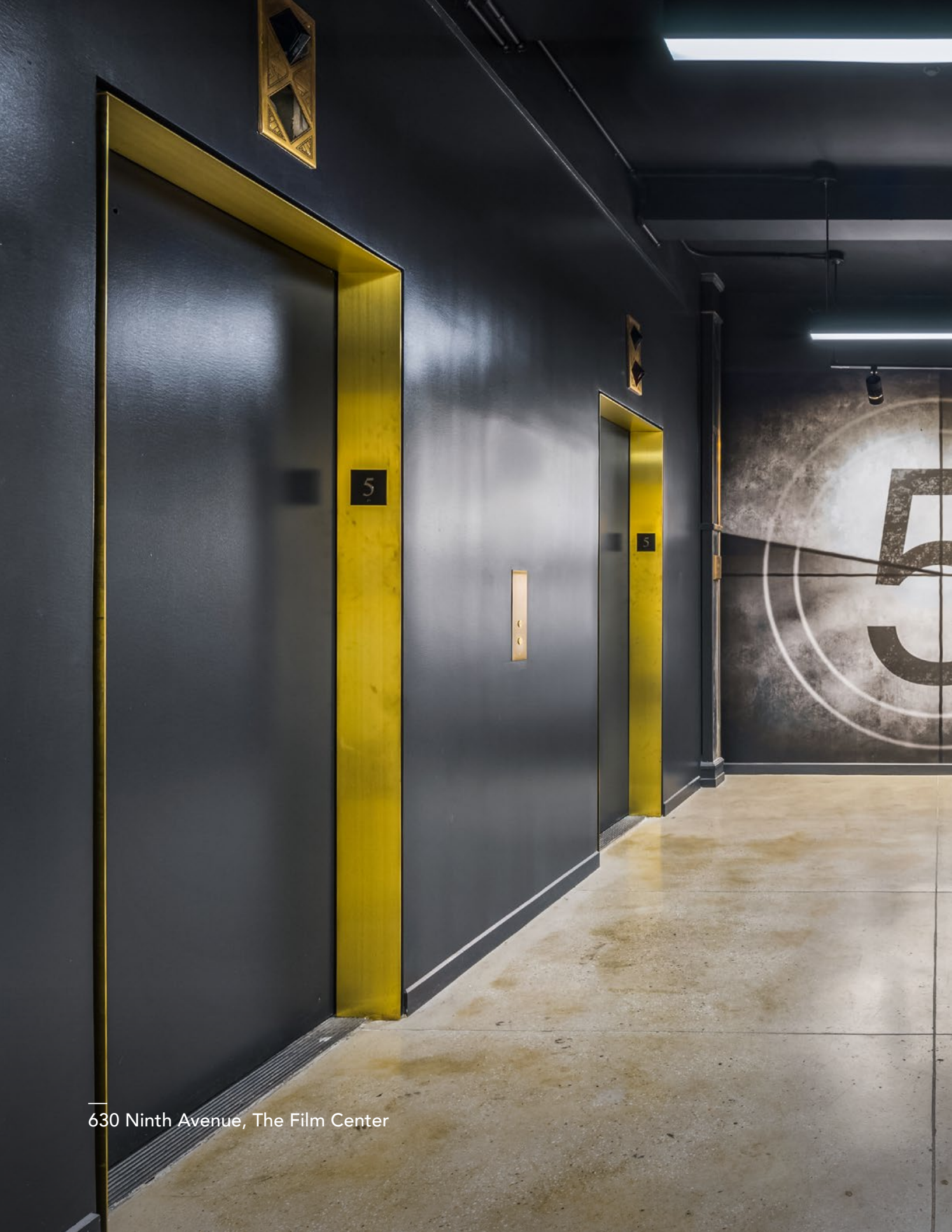
630 Ninth Avenue, The Film Center