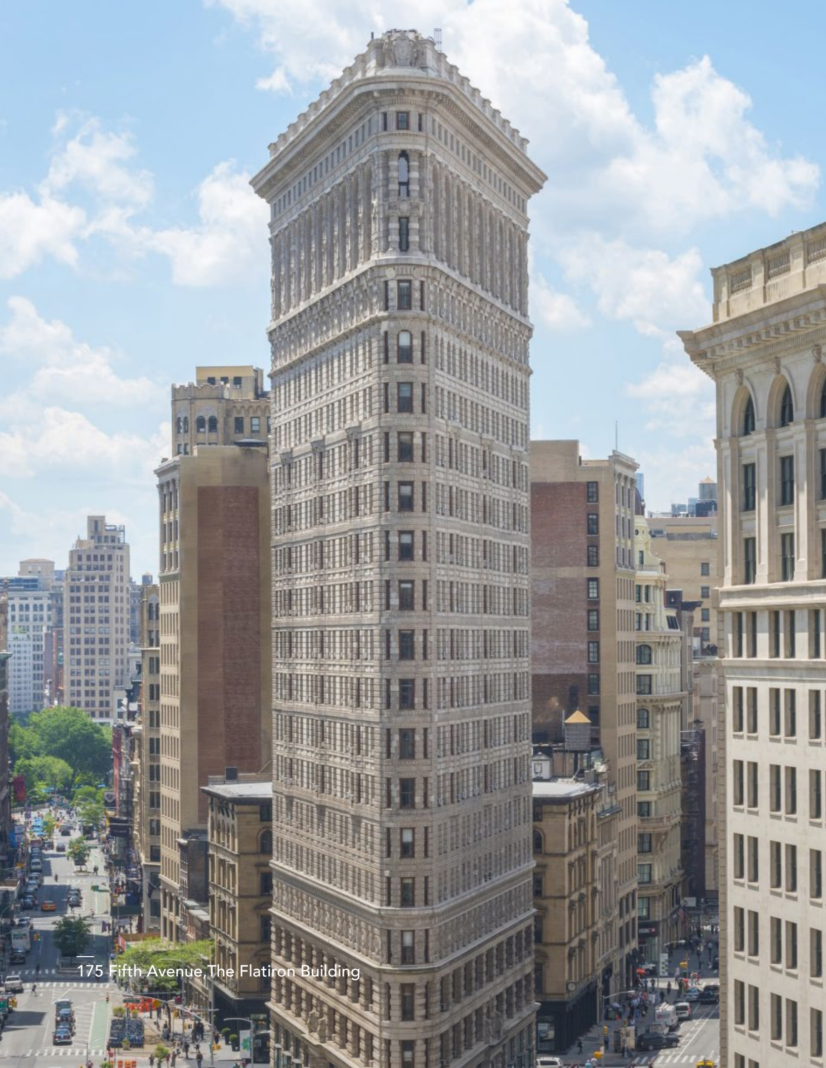
175 Fifth Avenue, The Flatiron Building