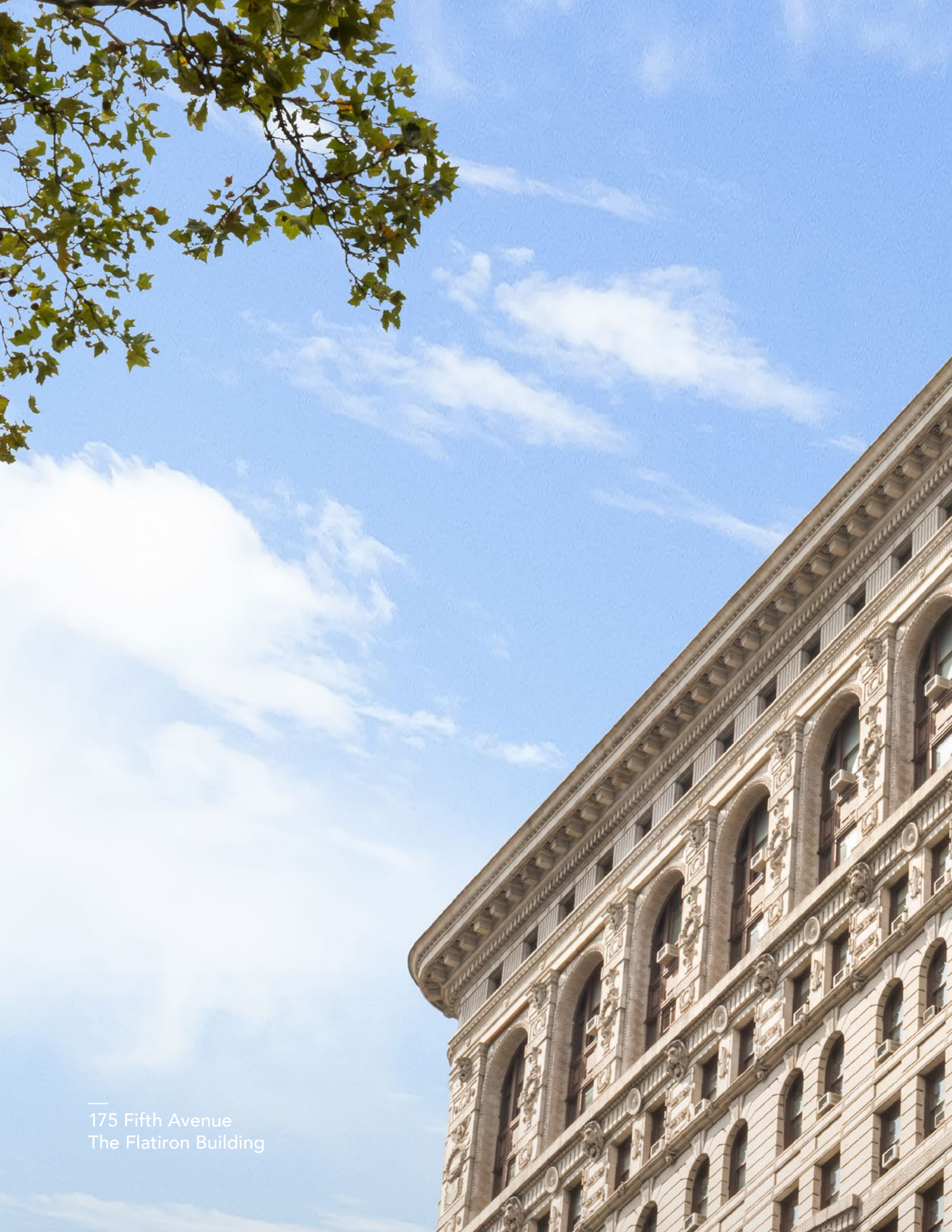
175 Fifth Avenue The Flatiron Building