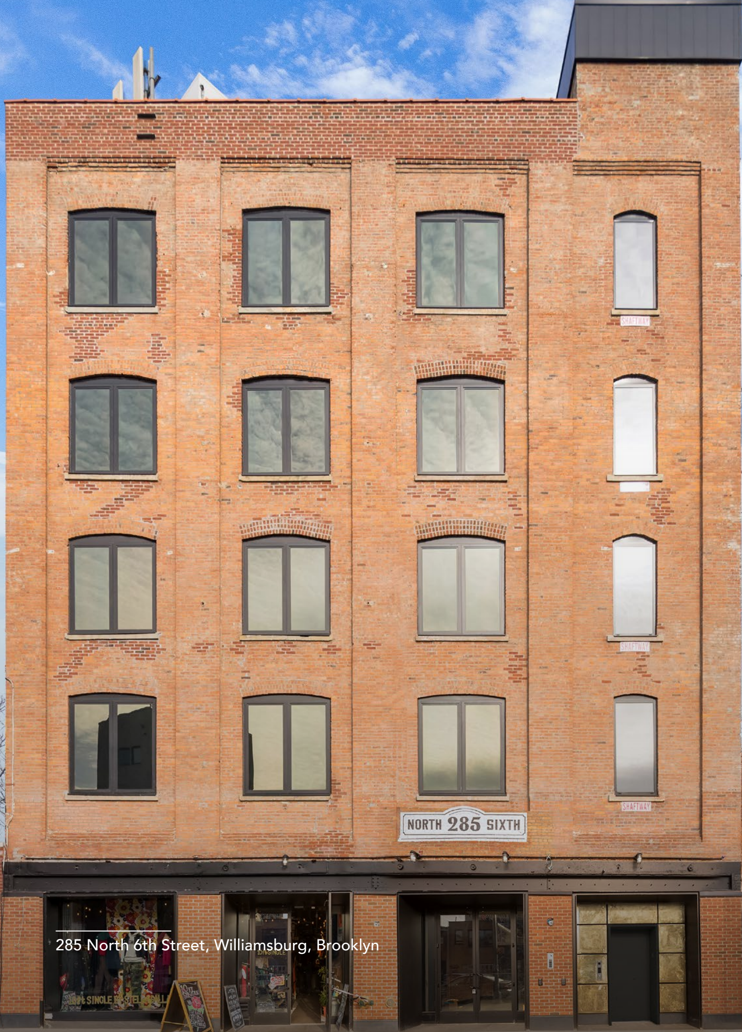
285 North 6th Street, Williamsburg, Brooklyn