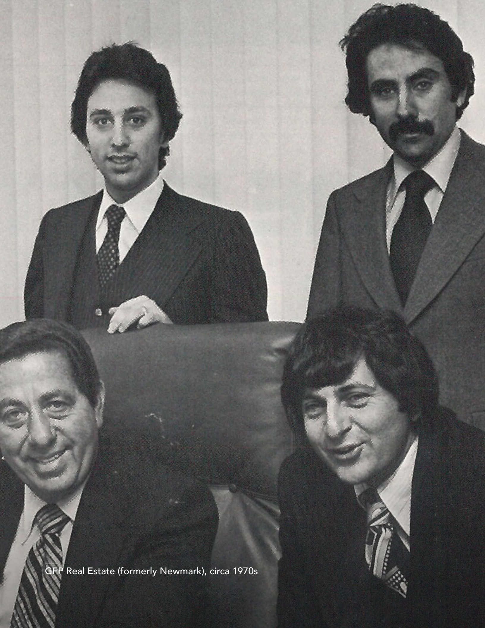
GFP Real Estate (formerly Newmark), circa 1970s