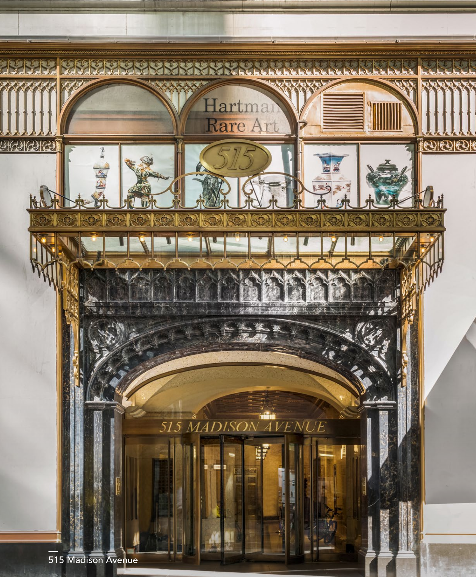
515 Madison Avenue