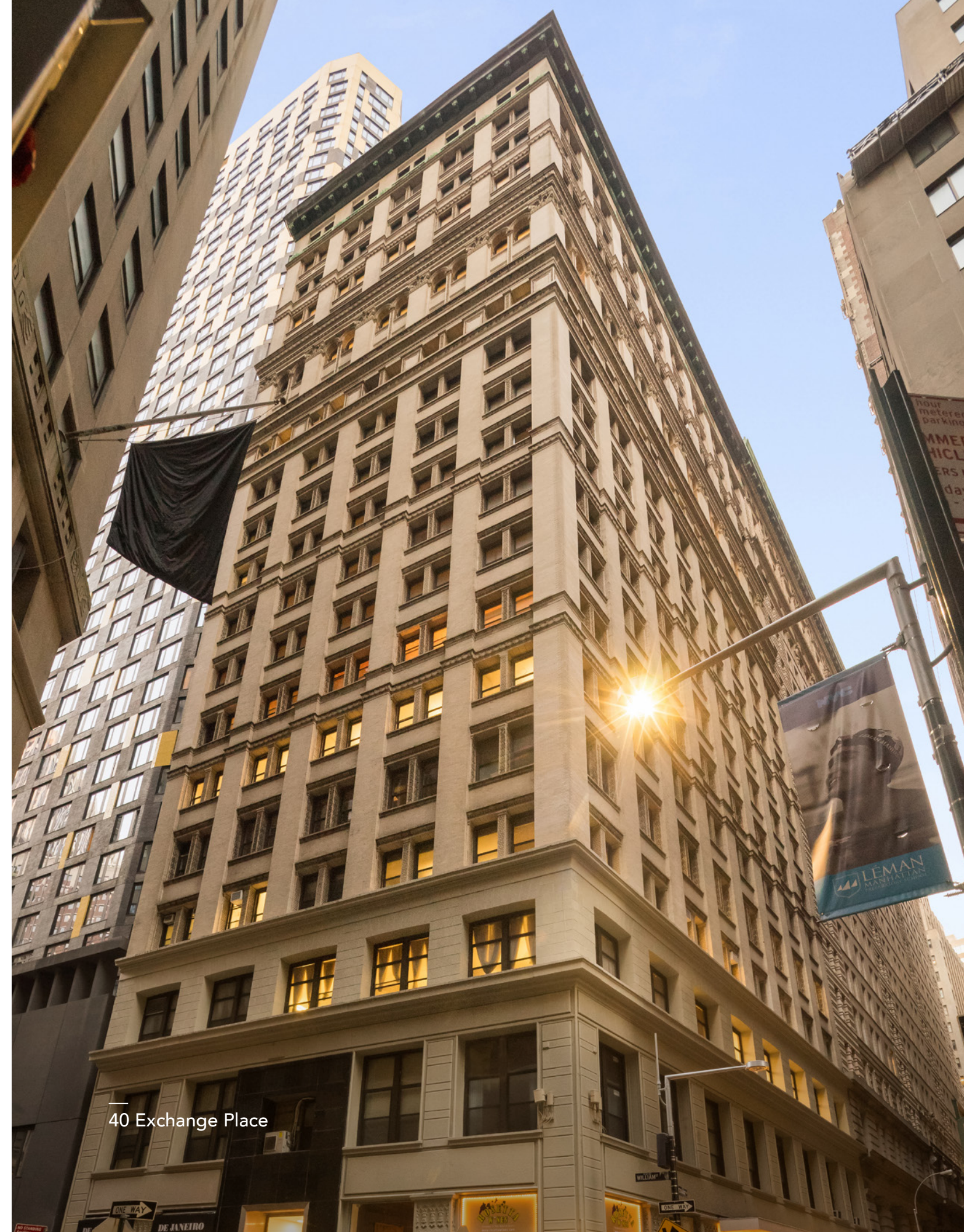
40 Exchange Place

tenant negotiations and prospect activity reporting. GFP's marketing team leads our corporate and portfolio strategic marketing and branding efforts in collaboration with the firm's other departments. GFP's team gets involved early in the design process to ensure consistency with the strategic plan for each property.