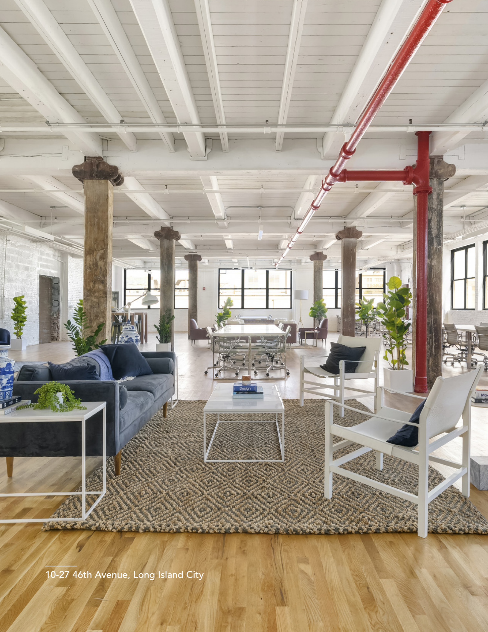
10-27 46th Avenue, Long Island City