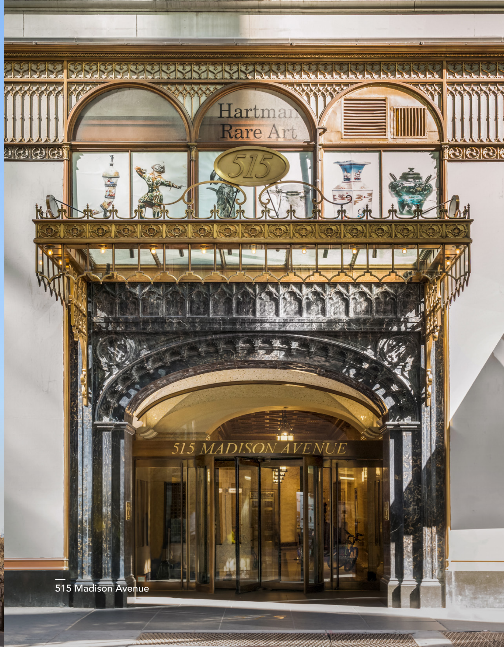
515 Madison Avenue