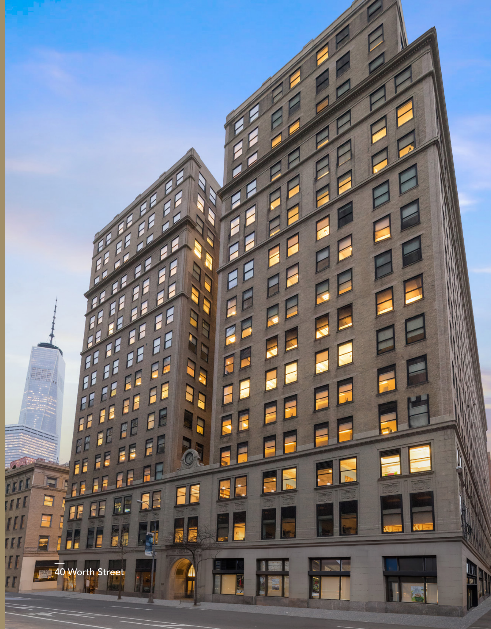
— 40 Worth Street