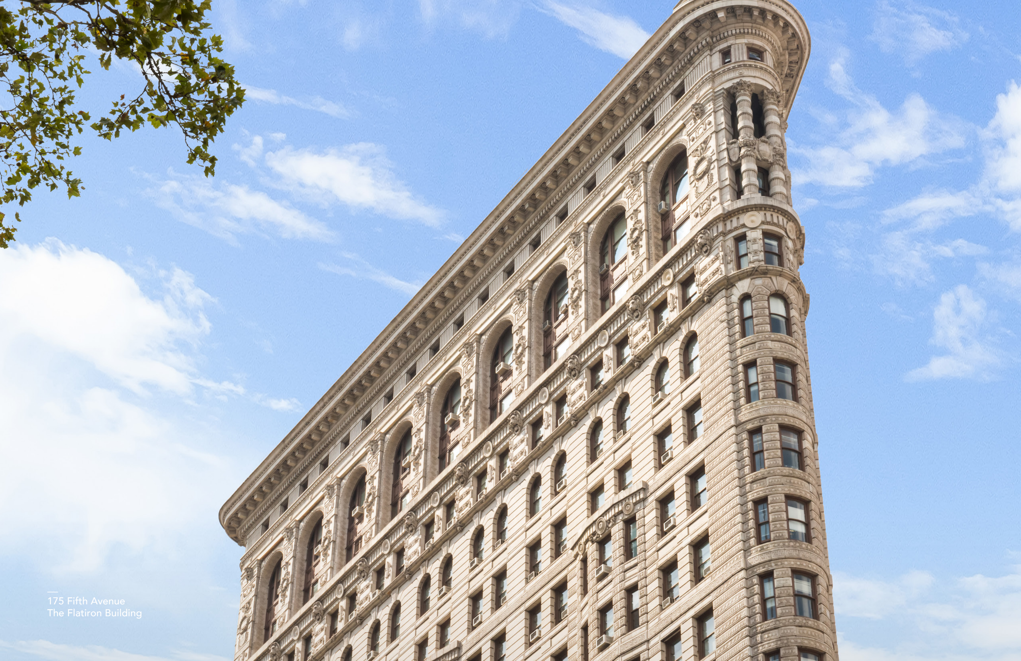
175 Fifth Avenue The Flatiron Building