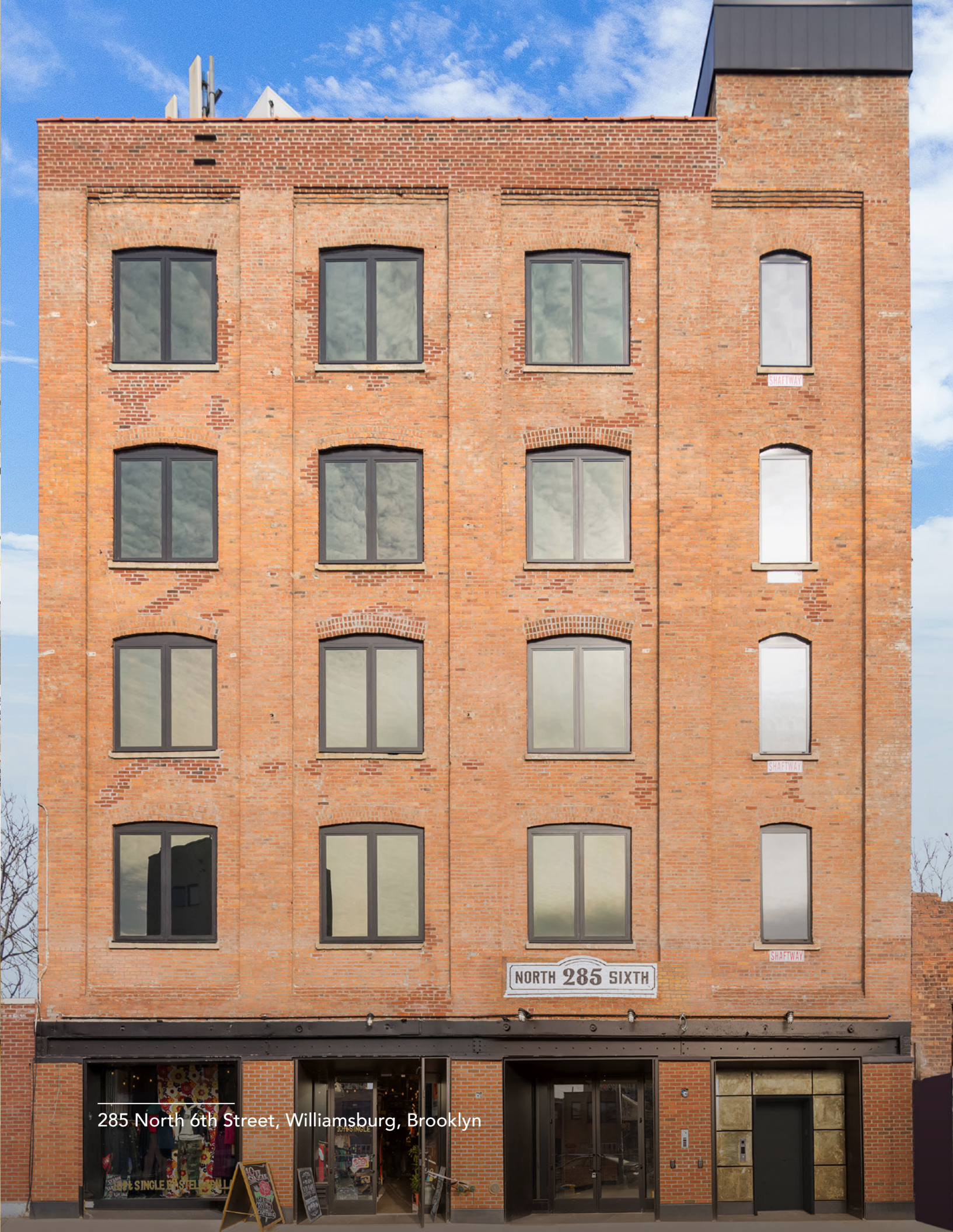
285 North 6th Street, Williamsburg, Brooklyn