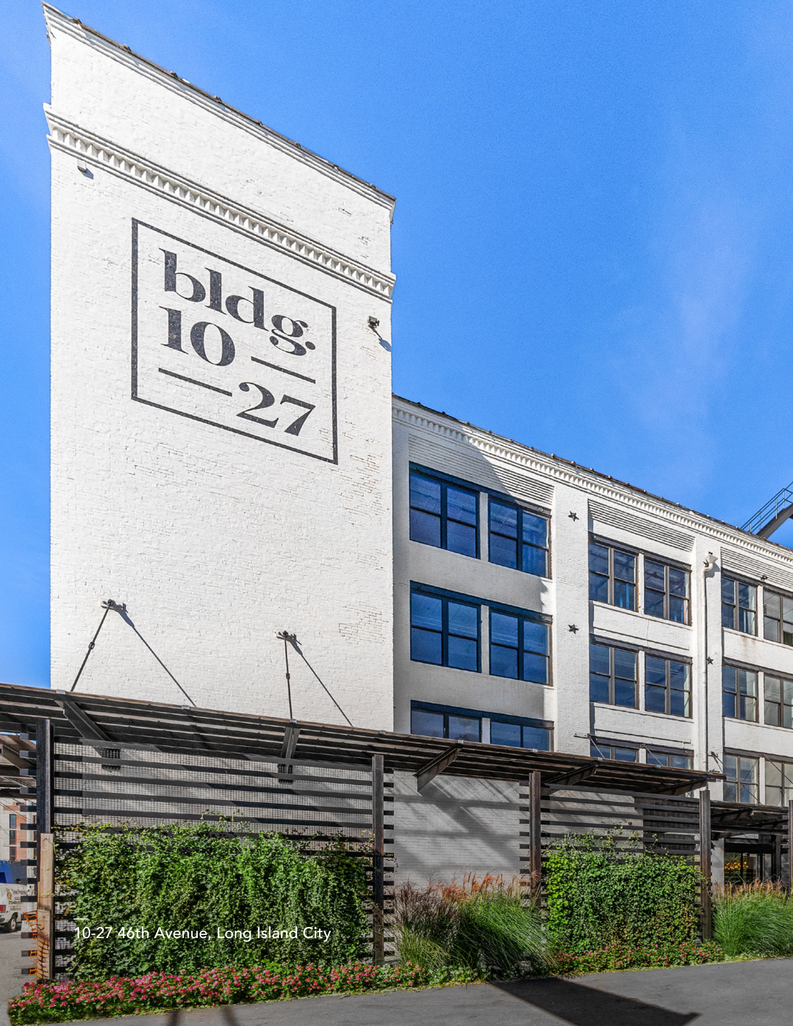
10-27 46th Avenue, Long Island City